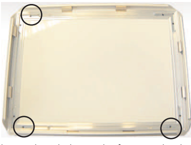
locate the 2 holes on the frame under the edging you would like to use